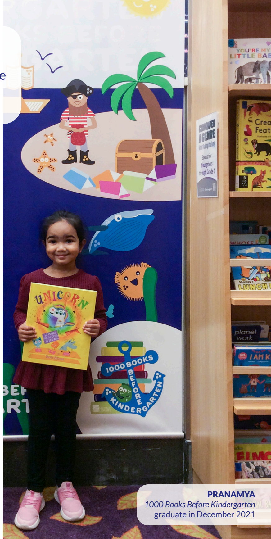
PRANAMYIA 1000 Books Before Kindergarten graduate in December 2021