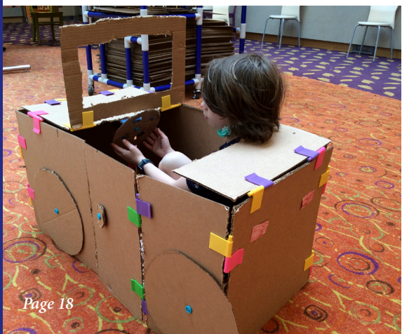
Youth coding class program Sphero Mini Robot Balls to roll through a maze. (Below left) Cardboard creations. (Below center) Teen Paint & Sip masterpiece. (Below right) First Presbyterian Preschool visiting for storytime.

It's just a joy to have a wonderful library in our city! Not only in a beautiful historic building, but with an outstanding highly qualified staff! Sandra