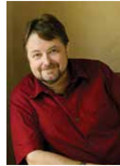
Luis Alberto Urrea

Lake Forest Reads: Ragdale 2014 is pleased to announce its 2014 book selection Into the Beautiful North by Luis Alberto Urrea